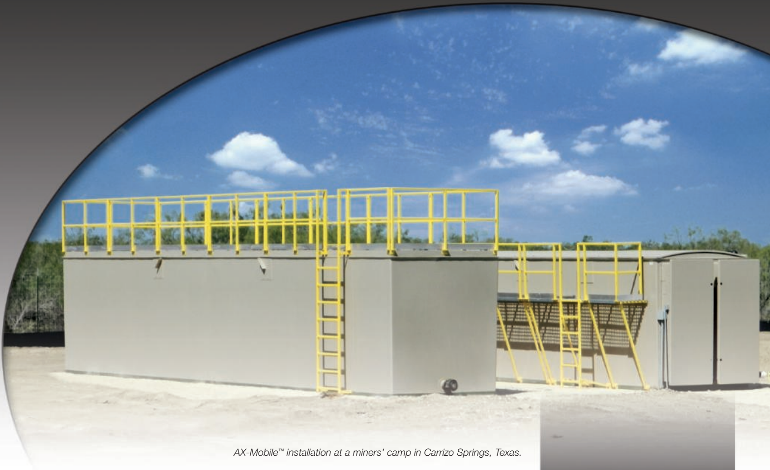
AX-Mobile™ installation at a miners' camp in Carrizo Springs, Texas.