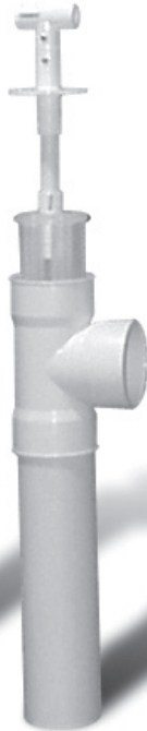
4-inch (100-mm) Biotube Jr. (4-inch Biotube cartridge available separately as Insert Filter)