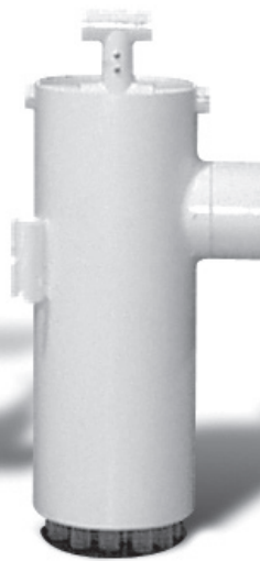
8-inch (200-mm) Base Inlet Filter