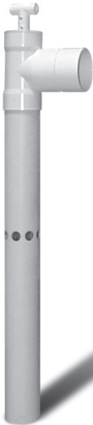
4-inch (100-mm) Biotube Effluent Filter